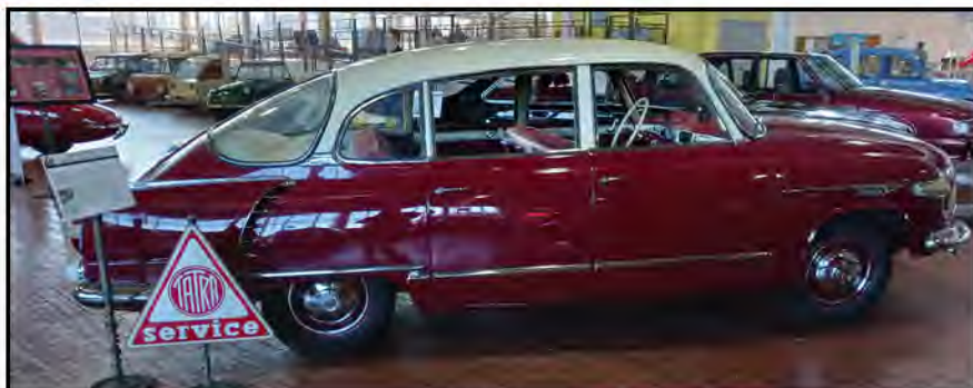
Lane Museum Tatra

First Sat. morning of the month Coffee and Cars at Old post office.