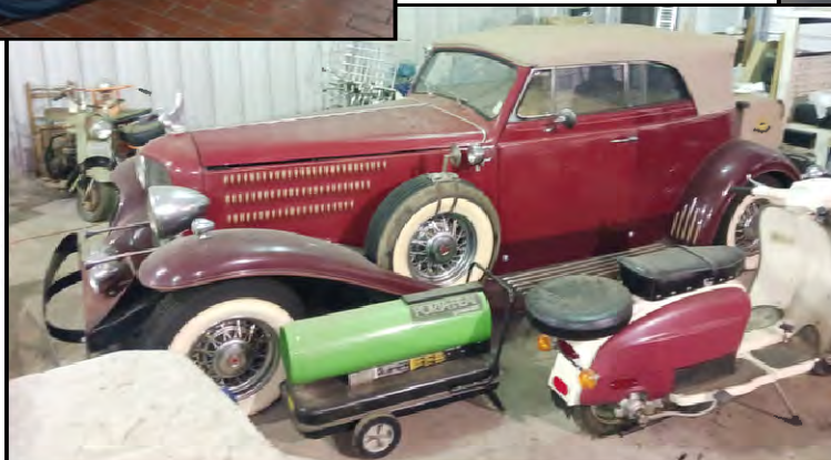
See Tatra on pg. 8.