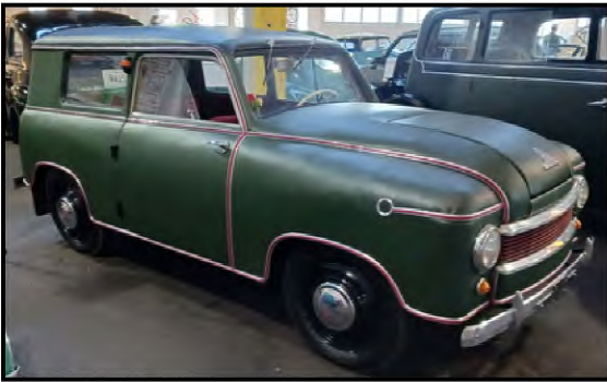
Fabric Car Anyone?