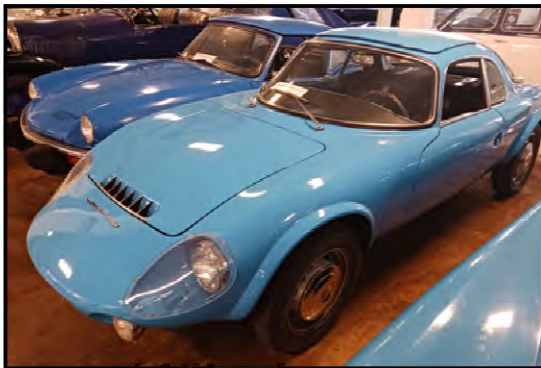
Pretty nice basement fare.