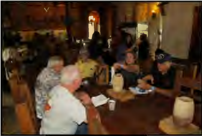
Eat a little something