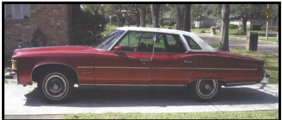
The Boggus 1976 Bonneville Brougham 4-door hardtop.on a poker run.