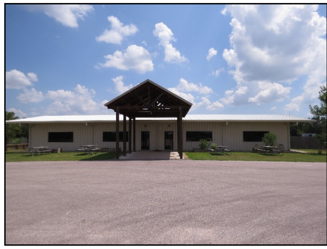
The Stephen F Austin Museum Building at 41885 State Hwy 299 Angleton, TX