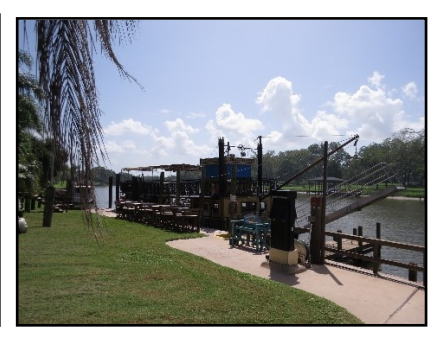
View of the "Docked" Paddle Wheel restaurant