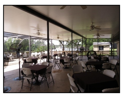
A covered patio eating option