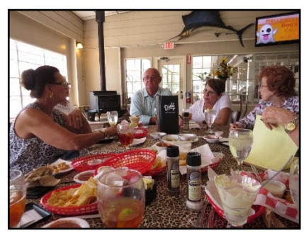
The Planning crew hard at work