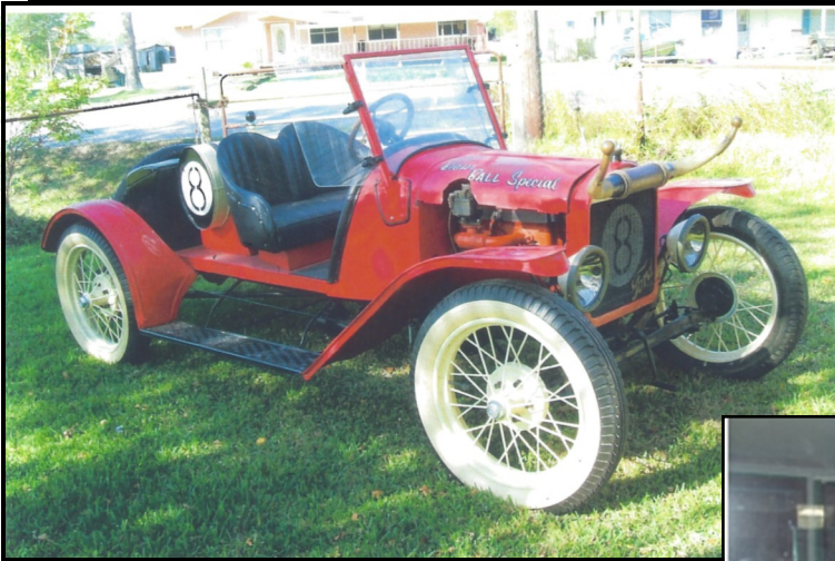
The Eight Ball Special

This "Channel Green" Tudor is the car he currently has. I had a better picture of the Coupe and it was his favorite so it is on the cover! (Editor)