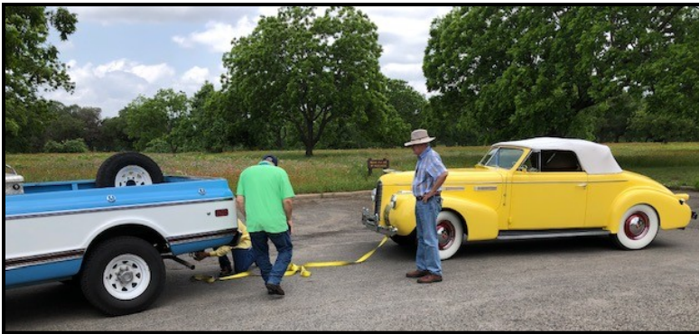
But then they weren't!! What happened?