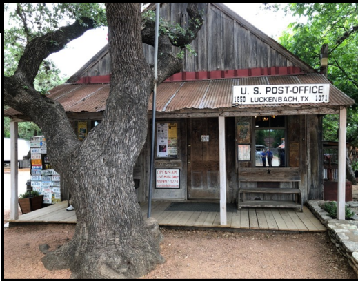
Yes, we went to Luckenbach!