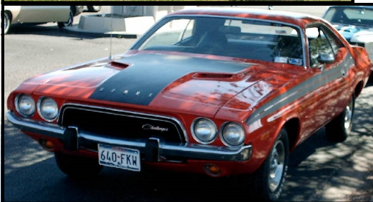
Don't they look nice lined up on the streets of Comfort?