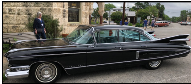
And quite a few "sharp" cars!