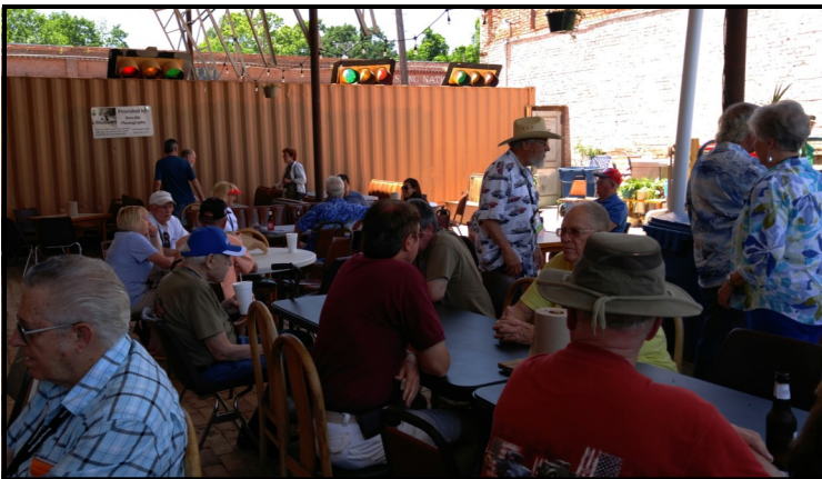
Tour folks enjoying lunch at 7th Street Cafe

Lots of nice cars on the judging field in Nacogdoches, over 80 of them.