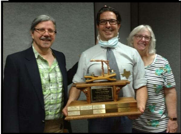
65th TEXAS TOUR-Nacogdoches