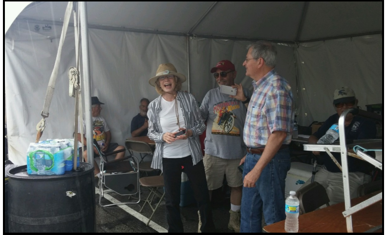
Under the big tent!.