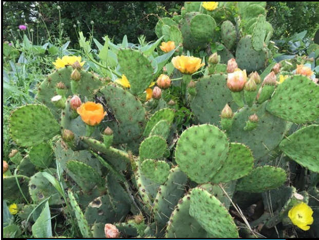
Pretty sights all around.