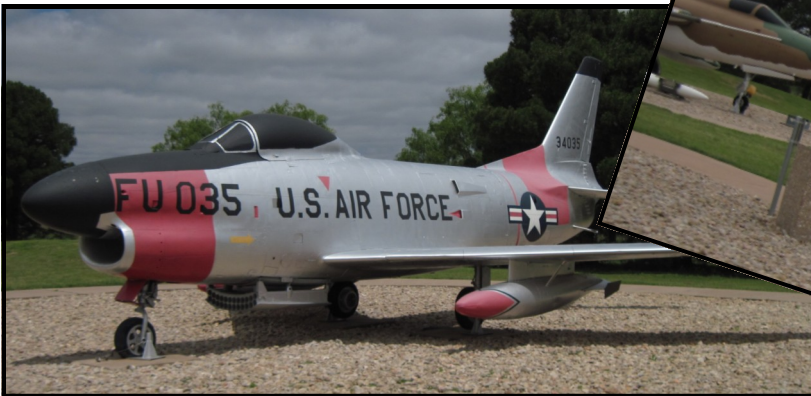
F-86 Fighter interceptor.