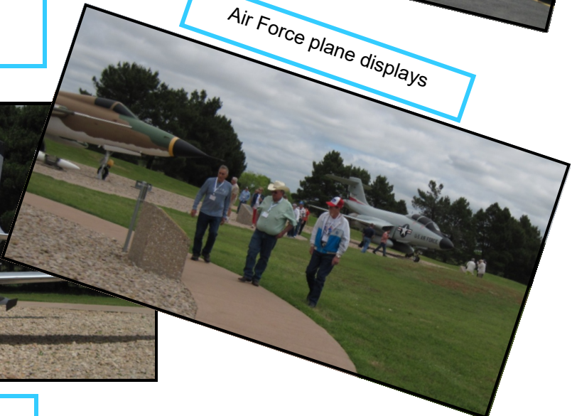
Air Force plane displays