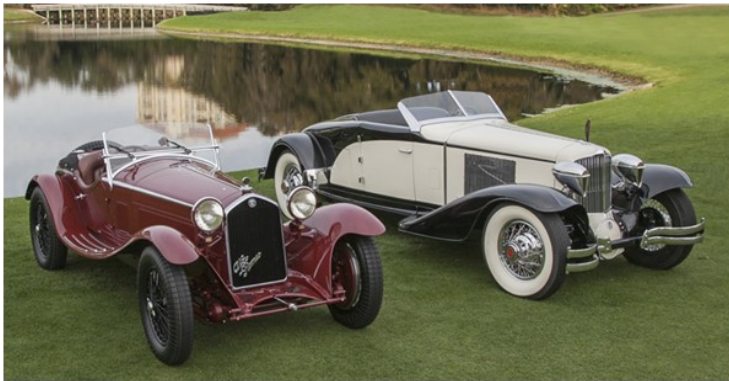
Best in Show Concours d'Sport 1932 Alfa Romeo 8C 2300