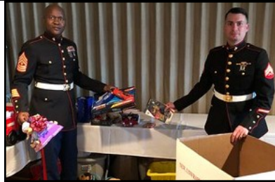
Our friendly Marines