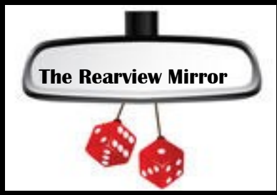
The Rearview Mirror