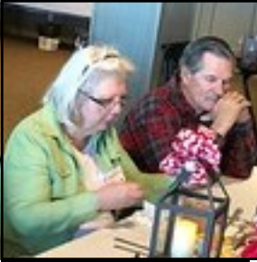
Somber thoughts of the food to come.