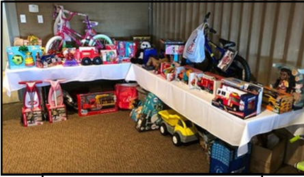
Lots of toys for tots!