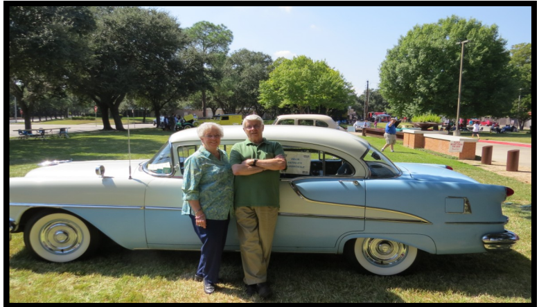
The Moores with their 1955 Oldsmobile.