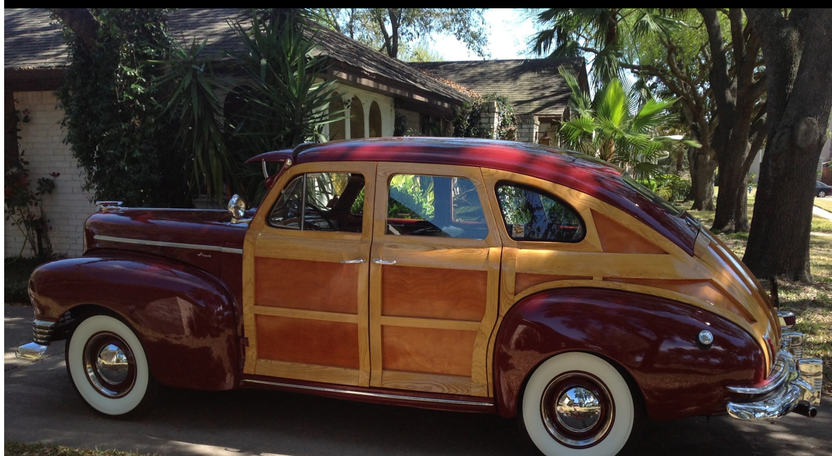
Or "A mother's nightmare and a teenager's dream..."

Thirty years ago while driving the same old route on Highway 59 going to my office, I happened to glance toward my left - and behind a gas station and hotel sat a maroon four-door unusually shaped 1940's classic – classic yes, as it had wooden doors and trunk.