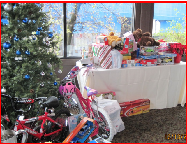
Spreading the cheer!