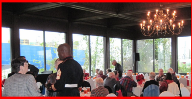
Enjoying good food and conversation!